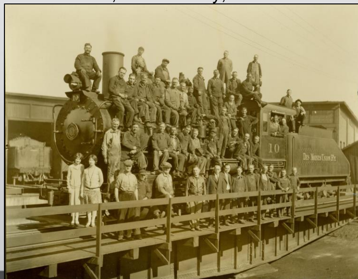
DSM Subject File, Railroads, PH1996- 27-1