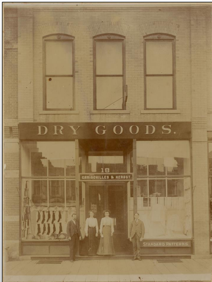
General Subject File, Business and Industry, Product Distribution, Dry Goods, PH1993-20-1