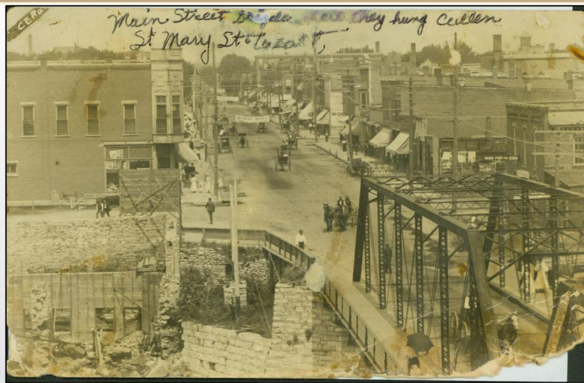
Cities File, Charles City, PH1999-47-17